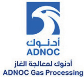
ADNOC Gas Processing